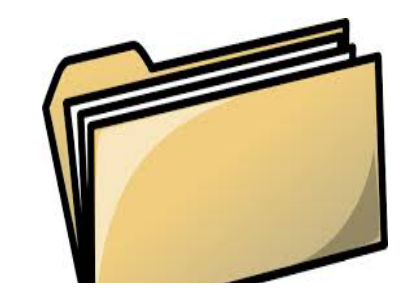
FRIDAY FOLDERS May 9, 2014

Municipal Offices 233 Atlantic Avenue North Hampton, NH 03862 papple@northhampton-nh.gov Tel: (603) 964-8087 Fax: (603) 964-1514